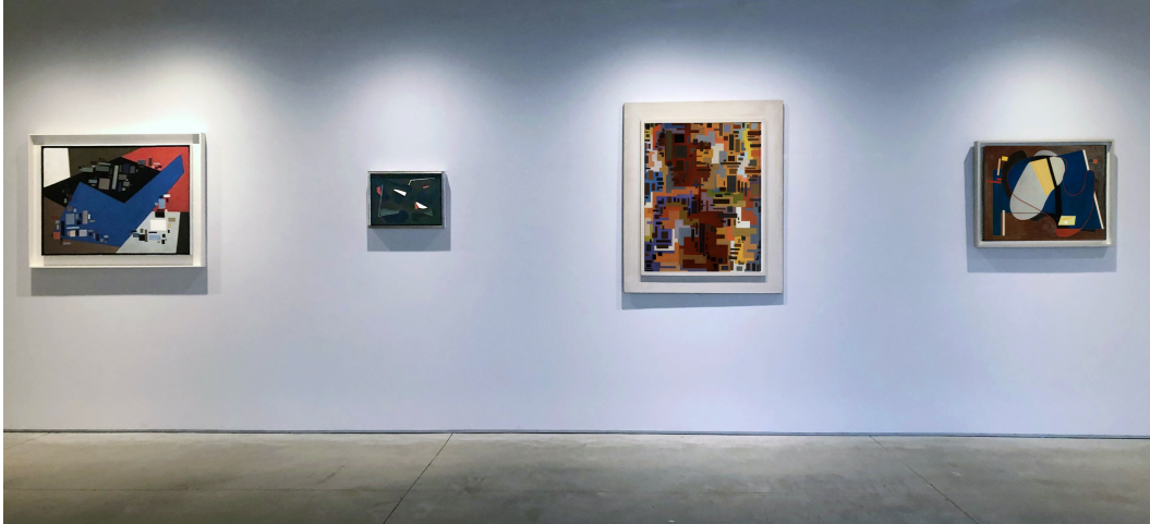
(From Right to Left) Oil on Composition , 1942, oil on composition board, 21 3/4 x 27 5/8 in. Collection of the Newark Museum of Art, 85.357, Gift of Jerry Leiber, 1985.

As visitors to Washburn will immediately notice, throughout her career Mason adhered closely to the classic conception of abstraction, which grew out of Cubism and relied on a fundamentally hard-edged approach, whether it be the straight lines of geometric abstraction or the curving, rounded ones of so-called biomorphic abstraction, or a combination of the two. One of her great influences was Piet Mondrian, who was a close friend of hers, especially during the time he lived in New York in the early '40s. One of Mason's greatest paintings, L'Hasard (1948), pulses with complex movements in multiple directions in a way that reminds one of the "Boogie Woogie" series that Mondrian painted in New York, though with a color palette more nuanced than Mondrian's primaries.